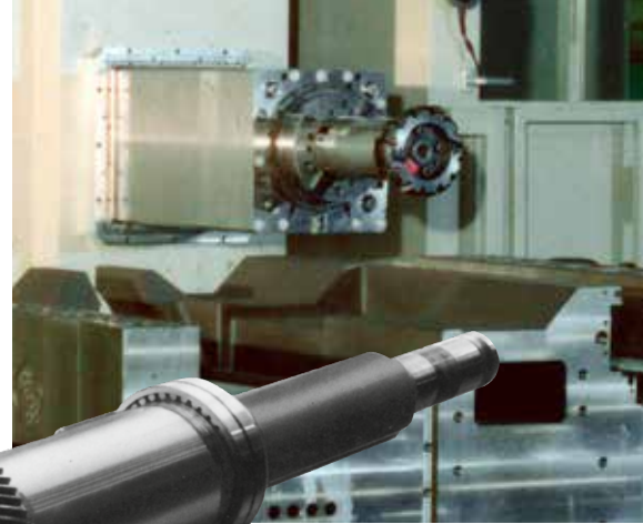
AM Boring spindle assemblies

A major advantage of AM telescopic feed screws is the possibility of combination with numerical control units of machining centers and their measuring systems. The automation of set-up and positioning processes by AM telescopic ball screws increases the process reliability and also reduces set-up times permanently.