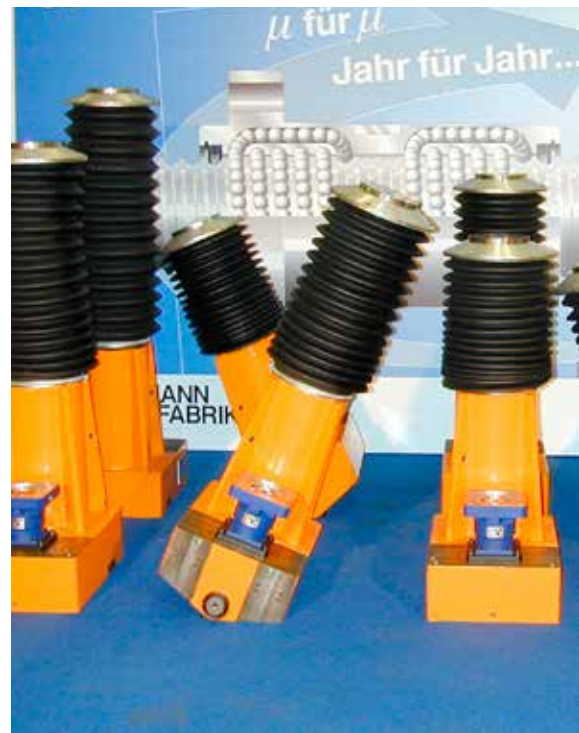
AM Telescopic ball screws

The characteristic performance values of AM products offer users the possibility of realizing highly dynamic machining processes in the design of machines, in an economical way for the benefit of customers.