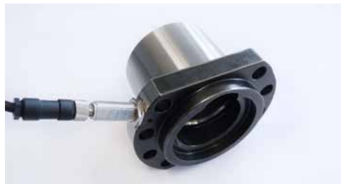
Sensor for temperature measurement on the nut flange

Long-term monitoring recognizes temperature trends. These show up and categorise situation- and time related changes early on, thus providing an important indicator regarding the service life of ball screw drives.